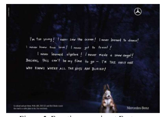
Figure 5. Function-prominent Feature

As one of the representatives of German cars, Audi is often regarded as a successful example of the German machinery industry. As shown in Figure 4, the advertisement for Audi A1 is a graphic with few words. From "A1" in the upper left corner to "End" in the lower right corner, various auto part icons are arranged in an orderly manner, and the text "BIG IDEA CONDENSED" in the middle gives the impression that the car is "condensed" from precision parts and big ideas from beginning to end, thus creating the outstanding simplified design and the structural feature of new Audi's.