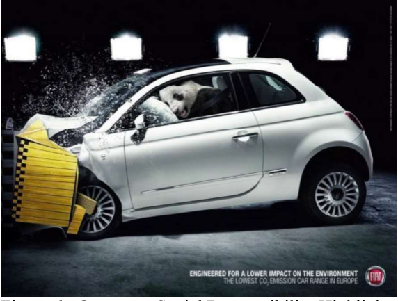
Figure 6. Corporate Social Responsibility Highlights

Here is an example of a multimodal ad from Fiat. Fiat, the largest automaker in Italy, manufactures one model of Fiat, one breed that focuses on corporate environmental awareness in its marketing ads. As shown in Figure 6, the advertisement picture shows a panda driving a Fiat, with the text "Engineered for a lower impact on the environment / THE LOWEST CO2 EMISSION CAR RANGE IN EUROPE); "Environmental Impact" and "CO2 Emissions" in the text activate readers' associations with the natural environment and animals (such as pandas), showing the environmental concerns during the engineering of the breed.