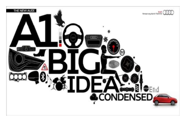
Figure 4. Design-prominent Feature

The brand power is closely related to the characteristic functions of automobiles, and vice versa. To build their brand and company image, many automobile companies highlight specific designs and functions of their products to enhance their distinct advantages. For example, Toyota is famous for its hybrid technology and many models (as a selling point); Honda is well-known for its turbo engine and chassis power technology; Mercedes-Benz and BMW of the German series are a perfect mix of luxury high-end and precision machinery; last but not least, American brands have the advantage of ample space and complete equipment. Take Audi and Mercedes-Benz in the 70 creative car advertisements selected by Design Your Way website as an example; the following analysis is made.