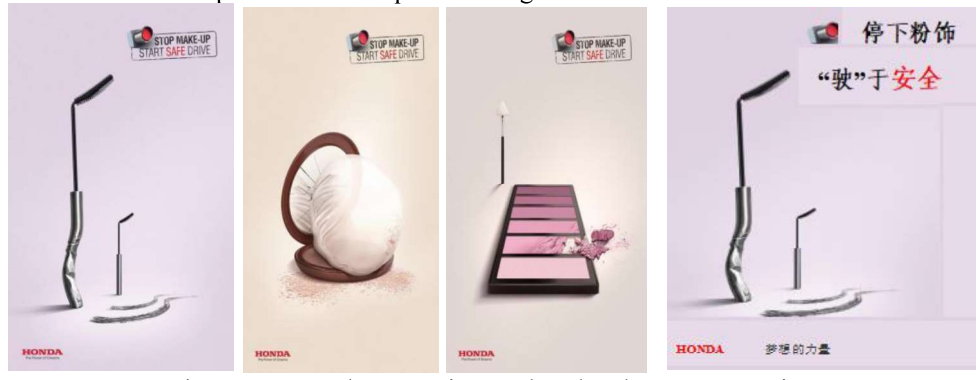
Figure 9. Metaphor-puns in Honda Ad and Its Transcreation

'驶'于安全" to transfer the metaphorical and the pun meaning.