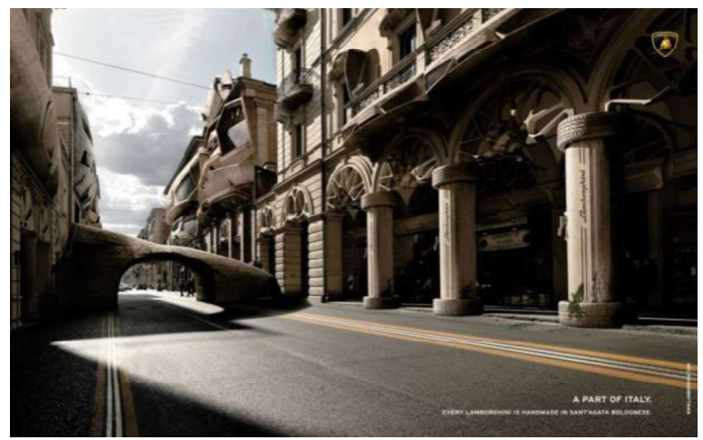
Figure 3. Brand-prominent Feature

like these ancient buildings, are made with hands, and the brand name on the building (pillar) gives potential buyers the feeling that the brand is as old as the city and it is part of Italian history.