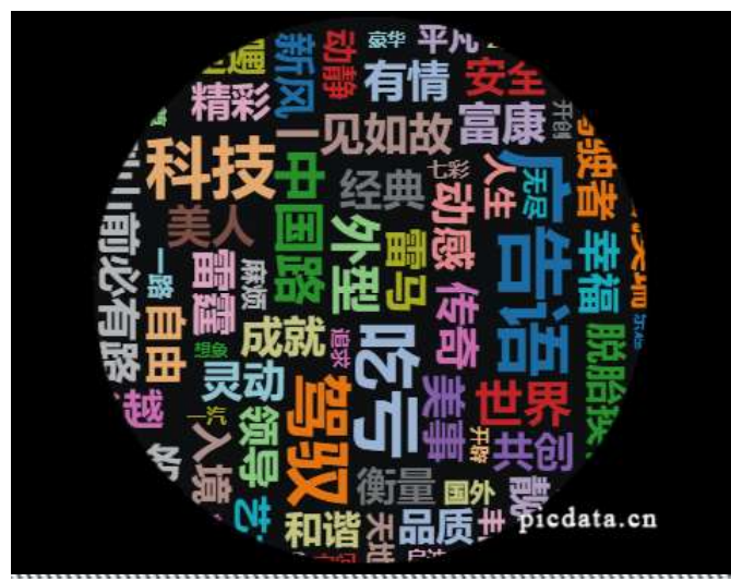
Figure 1. A Nephogram of Hi-frequency Characters in Chinese Auto Slogans

By building a small-scale corpus of Chinese auto slogans (a total of 3200 characters), we can find that the high-frequency words in the slogans include "bargain (吃亏)," "driving (驾驭)," "technology (科技)," "Chinese road (中国路)," "lines of the car (外型)," "world (世界)," "dynamic (动感)," "movements (动静)," "Life (人生)," "Model (典范)," "Excellent (卓越)," "Luxury (卓越)," among others. We use Tuyue Software to visualize the high-frequency keywords extracted from the database, as shown in Figure 1. It can be seen that driving experience, technology driving, and car appearance are the fundamental aspects highlighted in words. In addition, the Chinese car slogans are typically put in four-character formats or Chinese proverbs, and the Chinese cultural context. For instance, "坐红旗车,走中国路" (Take Hongqi auto and the Chinese road) and "杰作天成,一见如故" (An old acquaintance is born to be a masterpiece, VWGolf's slogan).