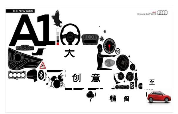
Figure 7. Transcreation of Multimodal Ad of Audi A1

When analyzing the translation of Audi A1 advertising slogans, researchers tend to discuss the text in the monomodal context, explaining that "the small model A1 is a perfect combination of high performance and innovative design. The integration of the compact model and the upgraded standard configuration reflects the excellent design ideas of Audi A1"(i.e., 玲珑小巧的奥迪 A1 是高性能和创新设计的完美结合 in Chinese) (Lu & Wang, 2014: 45). By putting the slogan in the visual-verbal context, we can easily connect the words with the pictorial factors, and we can understand that the "big" in the text modifies the idea or design concept, the "condensed" font is the smallest and placed at the end, and the parts of the car are "compressed" together with the text; so the "condensed" in the multimodal context is a graphic pun, that is, it not only expresses the pragmatic intention of "reducing the integration of auto parts and condensing the design concept," but also expresses the design concept of "the fusion of language symbols and other graphic symbols" through picture symbols. Therefore, when translating, we should pursue the equivalence of the compounded meaning of graphic, text, and pragmatics, and translate it in its original verbal-visual context. One possible version could be the following one: "大创意 精简至," which is equivalent to the original slogan in both lingual and pictorial modes.