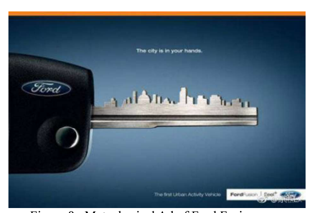
Figure 8. Metaphorical Ad of Ford Fusion